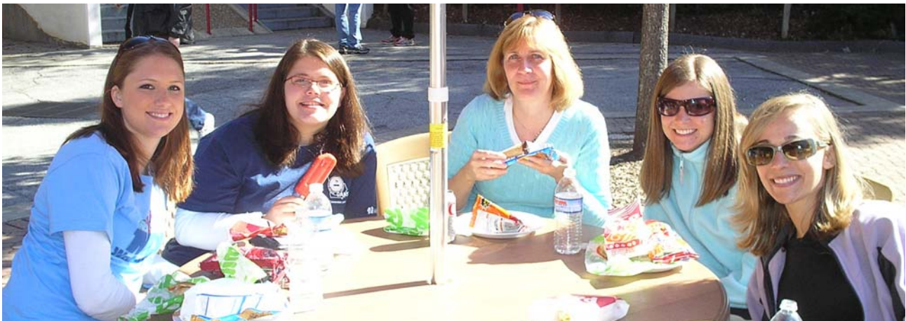
Friends and family enjoying the 2009 MDA Walk of Hope at Zoo Atlanta